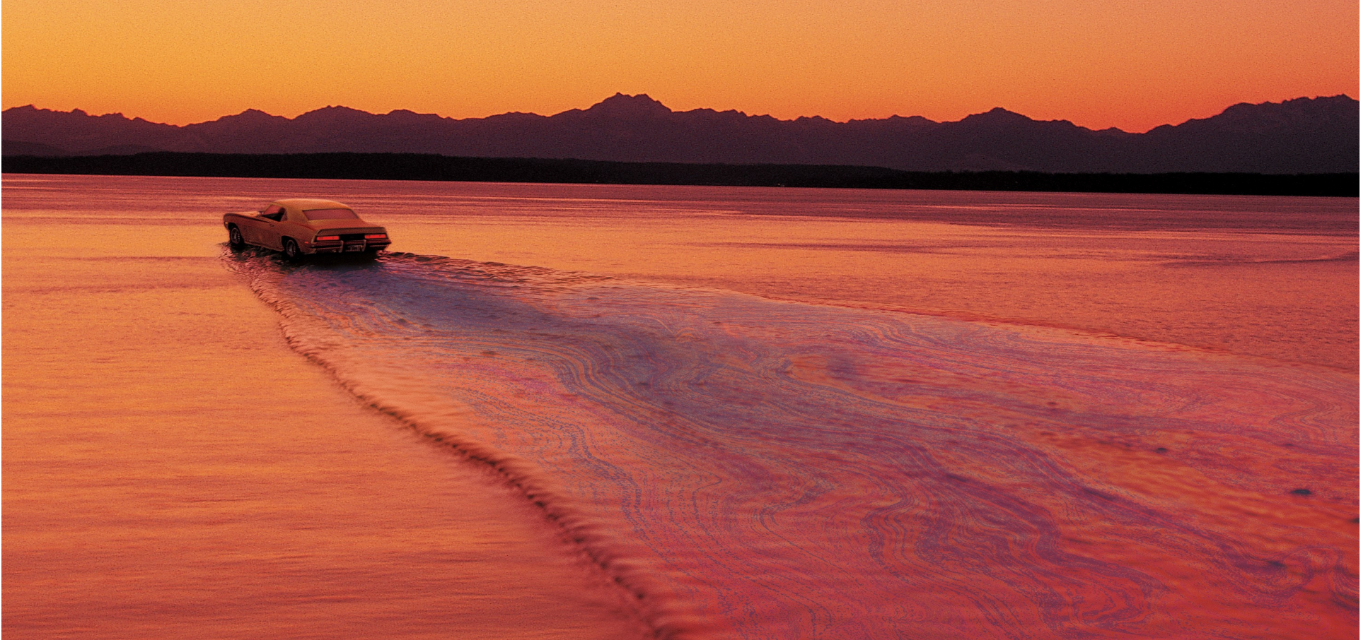
Image and text reprinted with permission from the Puget Sound Action Team, Department of Ecology, King County, and the cities of Bellevue, Seattle and Tacoma.

WHEN YOUR CAR'S LEAKING OIL ON THE STREET, REMEMBER IT'S NOT JUST LEAKING OIL ON THE STREET.